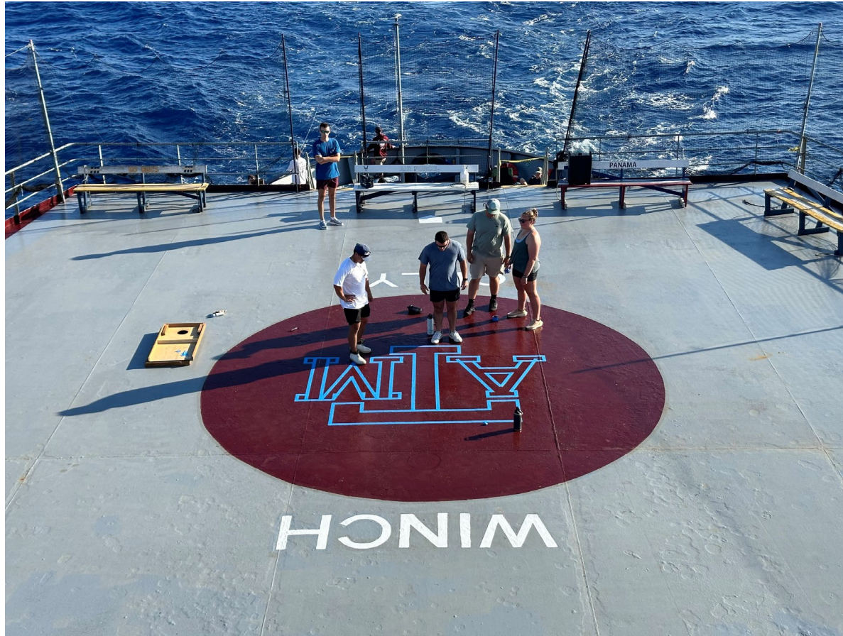
Working on the new Helo Pad emblem.