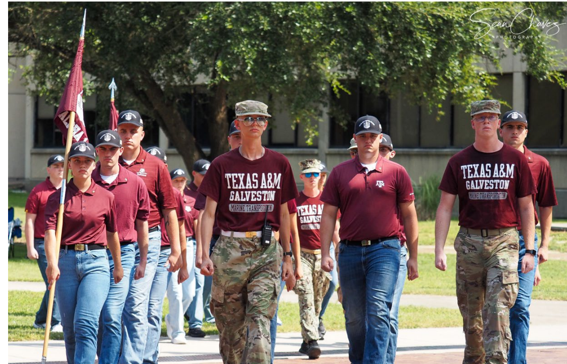
Company Pass in Review