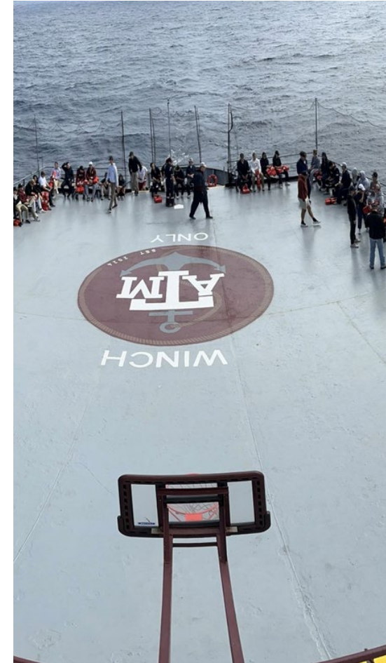
Finished Helo Pad