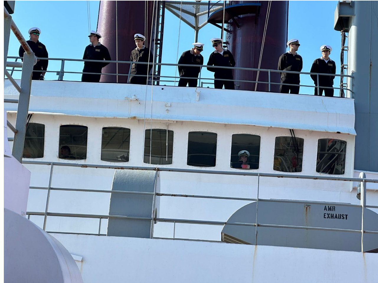
Cadets checking lifeboat supplies (left) and manning the rails (above).