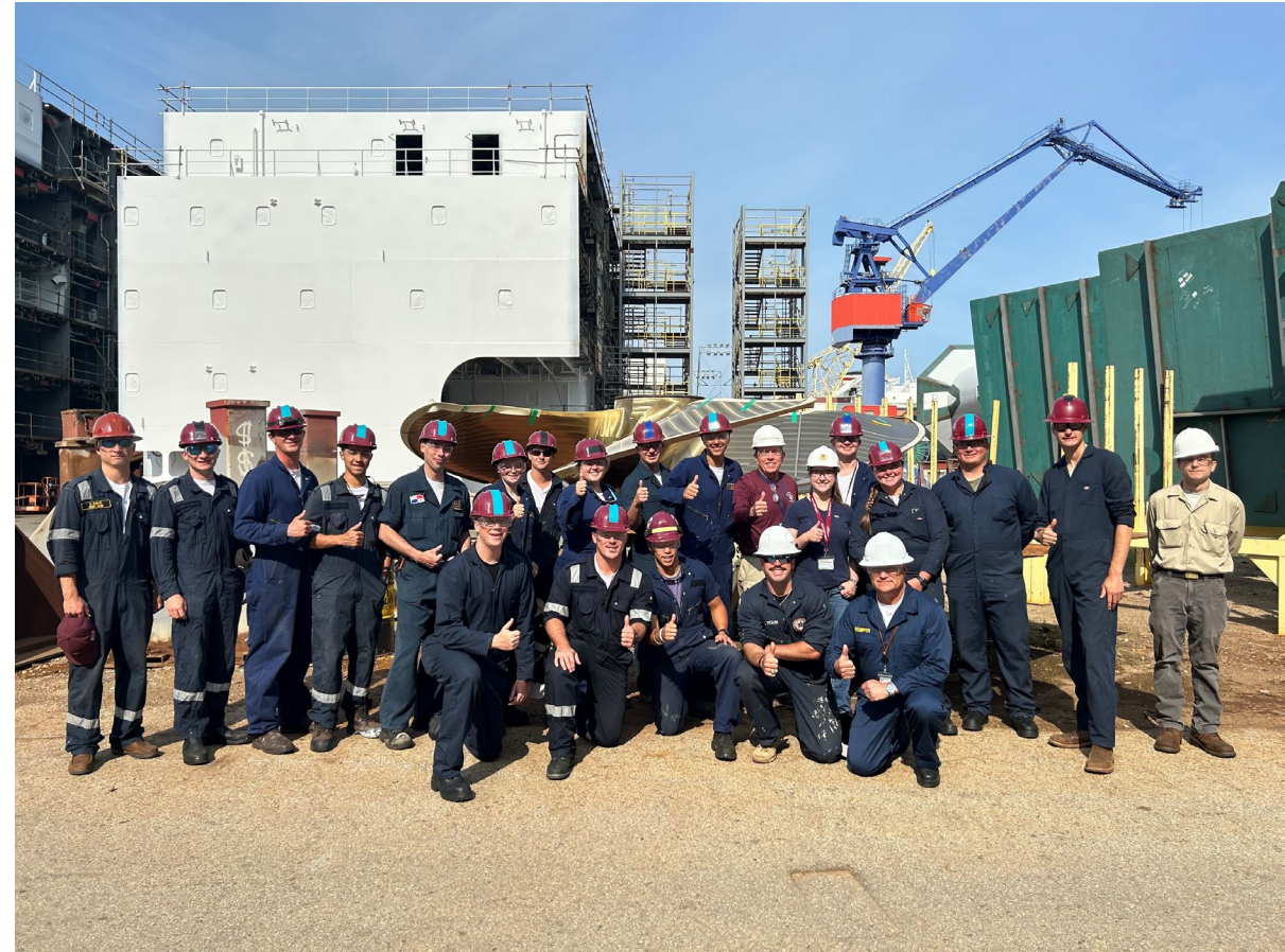
Cadets visit the Lone Star State.