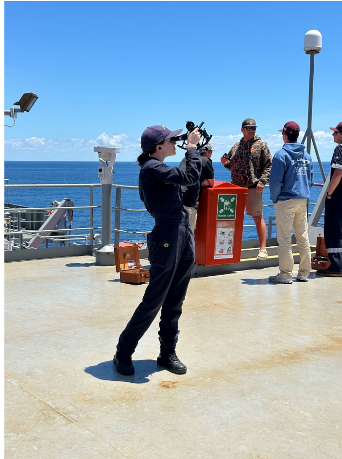
Celestial Navigation Course Work